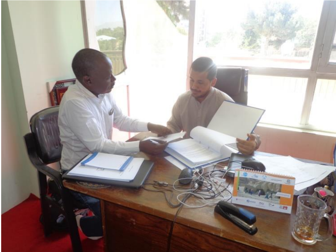
In white shirt, On-job mentoring session of M&E staff at Afghanistan Democracy and Development Organization ADDO office on 18th/Sept/2019, Kabul Afghanistan